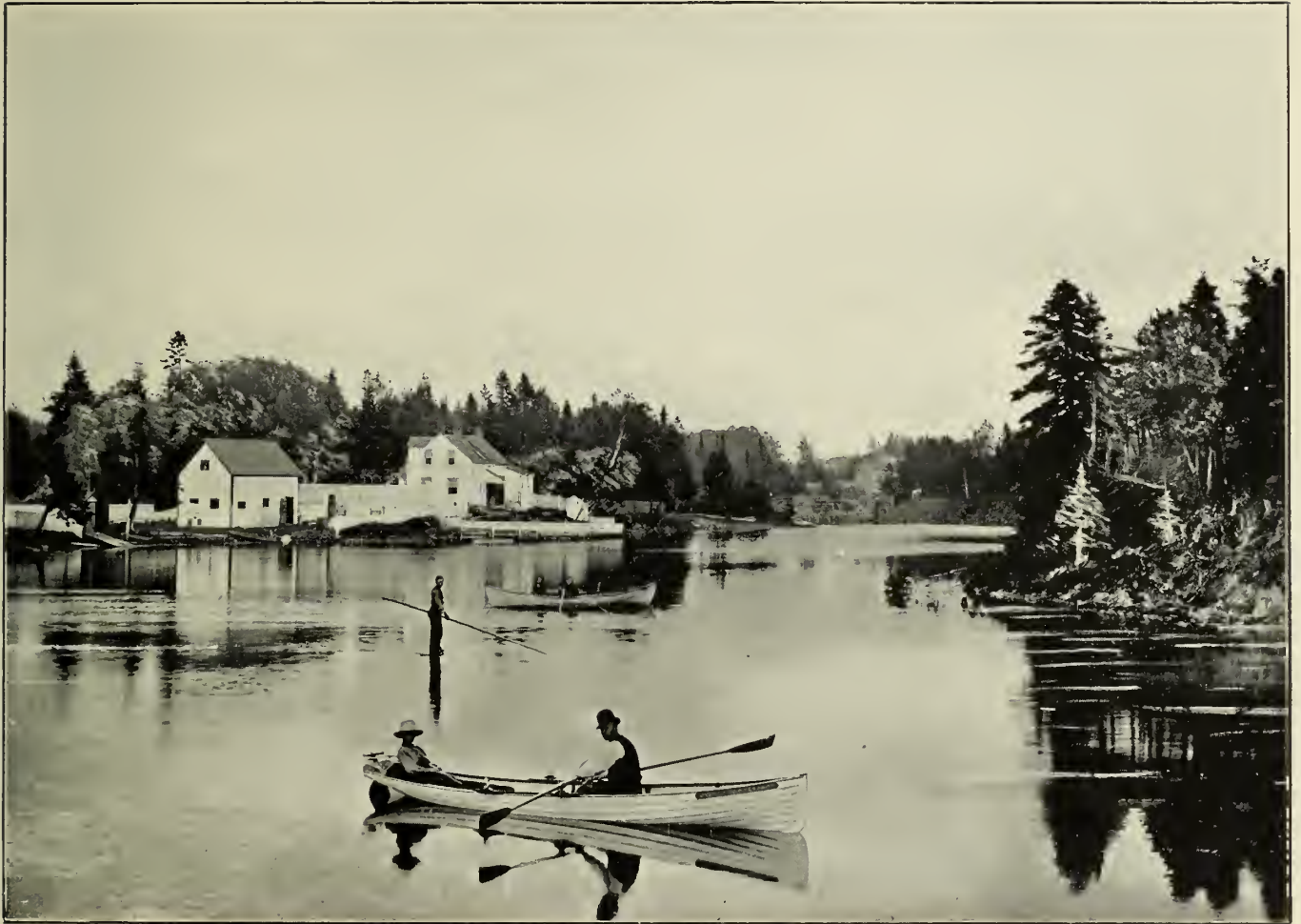
A CHARACTERISTIC CAPE BRETON BOATING SCENE, NEAR SYDNEY.